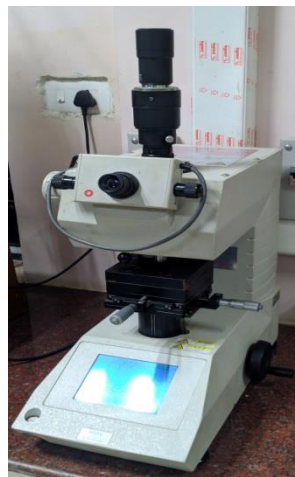
HMV Micro Hardness Tester

Model : Quanta Ray Model Pro-230-10 Pulse Duration : 10 ns Wavelength : 1064, 532, 355 and 266 nm Repetition rate : 10 Hz